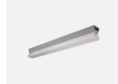
132-50031, S pendant profile 1000 mm