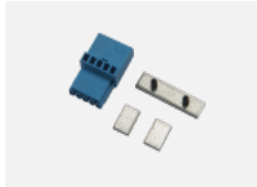
132-50201, F straight connector (for dimmable lum.)