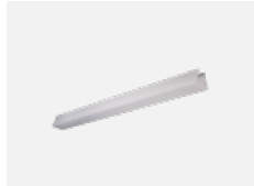
132-51100, K diffuser 2295 mm