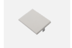
132-50100, S end cap