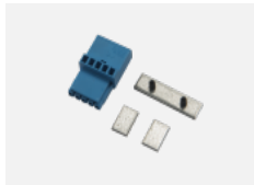
132-50201, F straight connector (for dimmable lum.)