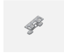
00-00600, F ceiling fastening for luminaires 132-5xxK, 04-2000x, 05-2000x, 09-200x - 1 piece