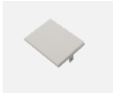
132-50100, B end cap