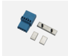
132-50201, F straight connector (for dimmable lum.)