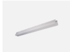
132-51100, K diffuser 2295 mm