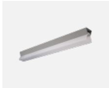
132-50031, B pendant profile 1000 mm