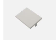
132-50100, B end cap