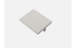
132-50100, S end cap