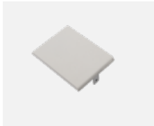
132-50100, B end cap