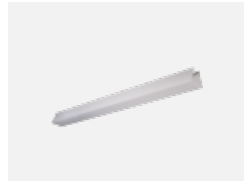
132-51100, K diffuser 2295 mm