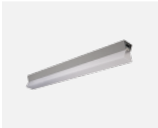
132-50031, B pendant profile 1000 mm