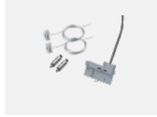
00-51300, B set for suspension into 3-phase track, non- dimmable luminaires