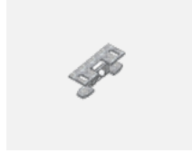
00-00600, F ceiling fastening for luminaires 132-5xxK, 04-2000x, 05-2000x, 09-200x - 1 piece