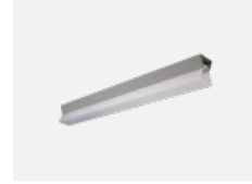
132-50031, B pendant profile 1000 mm