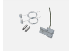
00-51301, W set for suspension into 3-phase track, dimmable luminaires