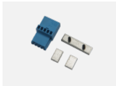
132-50201, F straight connector (for dimmable lum.)