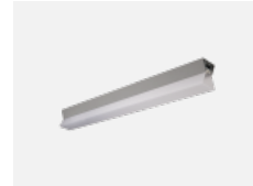
132-50031, W pendant profile 1000 mm