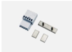
132-50200, F straight connector