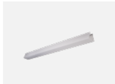
132-51100, K diffuser 2295 mm