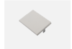
132-50100, W end cap