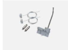
00-51300, W set for suspension into 3-phase track, non- dimmable luminaires