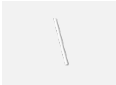
00-00355, W cable 5x0,75 2000mm, white