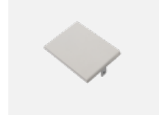
132-50100, B end cap