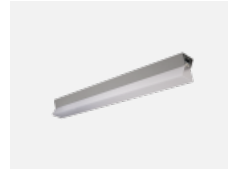
132-50031, W pendant profile 1000 mm