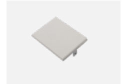
132-50100, W end cap