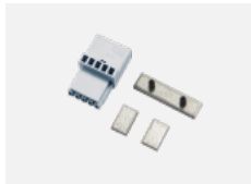
132-50200, F straight connector