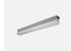
132-50031, W pendant profile 1000 mm