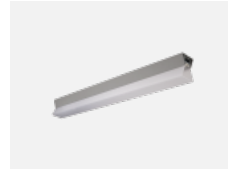
132-50031, B pendant profile 1000 mm