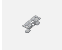
00-00600, F ceiling fastening for luminaires 132-5xxK, 04-2000x, 05-2000x, 09-200x - 1 piece