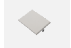
132-50100, B end cap