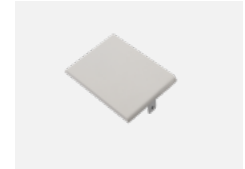
132-50100, S end cap