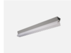
132-50031, S pendant profile 1000 mm