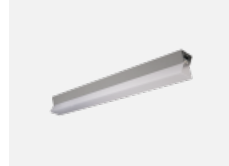
132-50031, W pendant profile 1000 mm