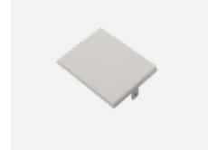
132-50100, W end cap