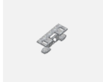
00-00600, F ceiling fastening for luminaires 132-5xxK, 04-2000x, 05-2000x, 09-200x – 1 piece