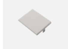
132-50100, S end cap