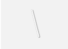
00-00355, W cable 5x0,75 2000mm, white