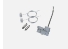
00-51300, W set for suspension into 3-phase track, non- dimmable luminaires