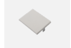
132-50100, W end cap