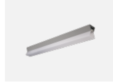
132-50031, W pendant profile 1000 mm