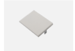
132-50100, S end cap