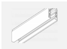
XTS4200-1, grey linear track 2m, grey