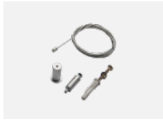
00-00300, N wire suspension 2000mm