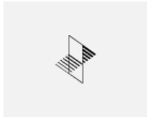
128-20101, W 2xend cap