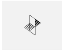
128-20200, N arranging coupler