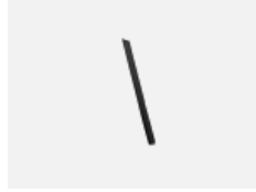
00-00352, B cable 3x0,75 2000mm, black