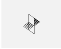
128-20101, W 2xend cap