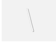
00-00352, W cable 3x0,75 2000mm, white