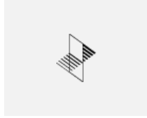
128-20200, N arranging coupler