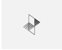
128-20101, B 2xend cap