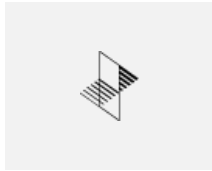
128-20101, S 2xend cap