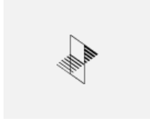
128-20101, B 2xend cap