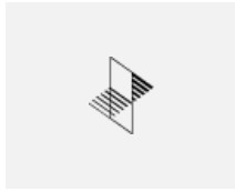
128-20101, W 2xend cap