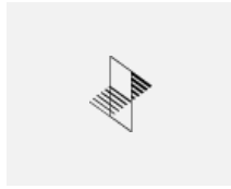
128-20200, N arranging coupler