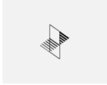
128-20101, S 2xend cap