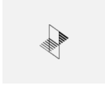
128-20101, S 2xend cap