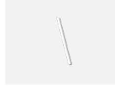
00-00356, W cable 5x0,75 4000mm, white