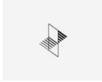
128-20200, N arranging coupler