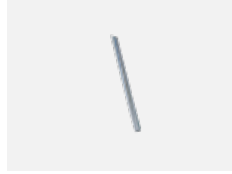
00-00352, K cable 3x0,75 2000mm, transparent