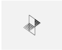
128-20101, B 2xend cap