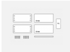
121-20101, B 2xend cap - plastic