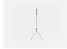
121-00300, N wire suspension 2000mm