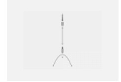
121-00301, N wire suspension 4000mm