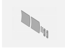
121-00200, N straight connector