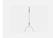
121-00300, N wire suspension 2000mm