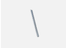
00-00365, K cable 5x1,5 6000mm