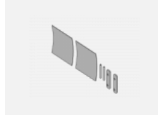
121-00200, N straight connector