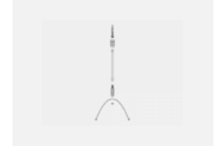
121-00301, N wire suspension 4000mm