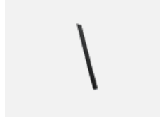
00-00360, B cable 3x0,75 6000mm, black