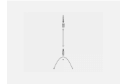
121-00301, N wire suspension 4000mm