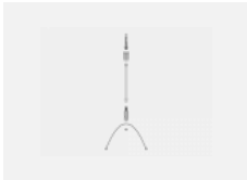
121-00302, N wire suspension 6000mm