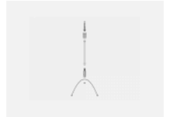
121-00301, N wire suspension 4000mm