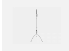
121-00300, N wire suspension 2000mm