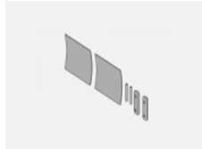
121-00200, N straight connector