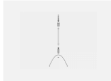
121-00300, N wire suspension 2000mm