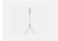
121-00301, N wire suspension 4000mm