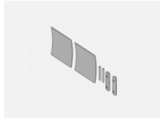
121-00200, N straight connector