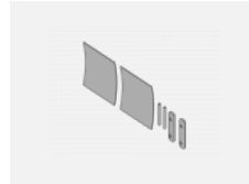
121-00200, N straight connector