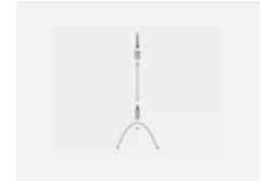
121-00301, N wire suspension 4000mm