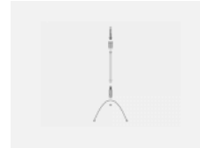
121-00300, N wire suspension 2000mm