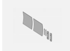
121-00200, N straight connector