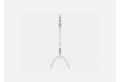
121-00301, N wire suspension 4000mm