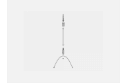
121-00301, N wire suspension 4000mm