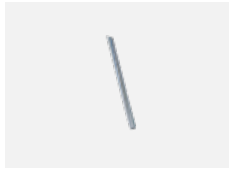
00-00352, K cable 3x0,75 2000mm, transparent