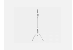
121-00301, N wire suspension 4000mm