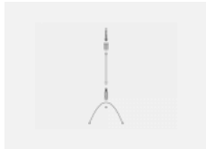
121-00302, N wire suspension 6000mm