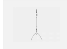
121-00300, N wire suspension 2000mm