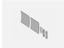
121-00200, N straight connector