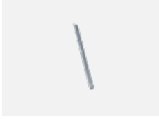
00-00352, K cable 3x0,75 2000mm, transparent