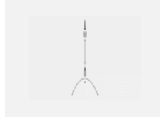
121-00300, N wire suspension 2000mm