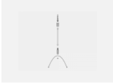
121-00302, N wire suspension 6000mm