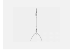
121-00301, N wire suspension 4000mm