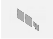
121-00200, N straight connector