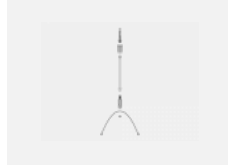
121-00300, N wire suspension 2000mm