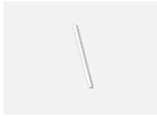
00-00352, W cable 3x0,75 2000mm, white