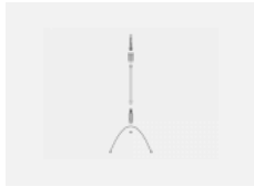
121-00302, N wire suspension 6000mm