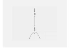
121-00301, N wire suspension 4000mm