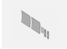
121-00200, N straight connector