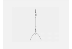
121-00301, N wire suspension 4000mm