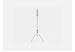
121-00301, N wire suspension 4000mm