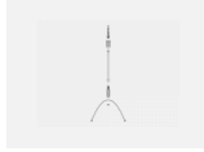
121-00300, N wire suspension 2000mm