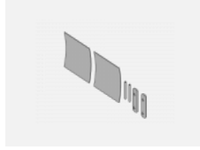
121-00200, N straight connector