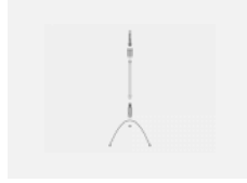
121-00300, N wire suspension 2000mm