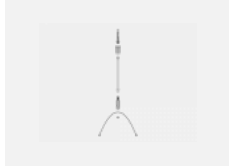
121-00302, N wire suspension 6000mm