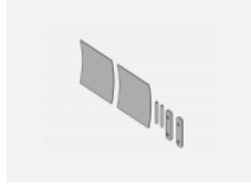
121-00200, N straight connector