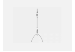
121-00301, N wire suspension 4000mm